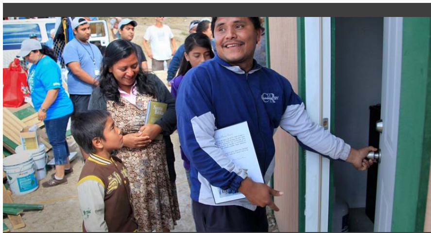
HOMES OF HOPE